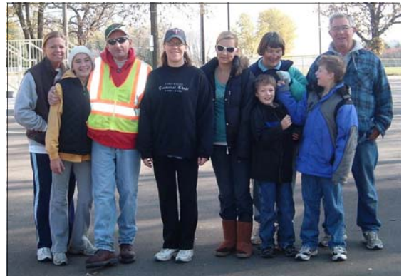
The clean-up crew for Adopt-a-Highway on October 25