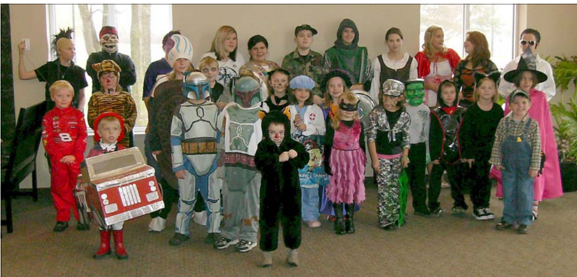
Lots of fun at the Sunday School Halloween Party on October 26.